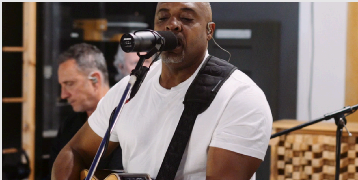
Hold My Hand- Hootie & The Blowfish (Southern Style Cover).