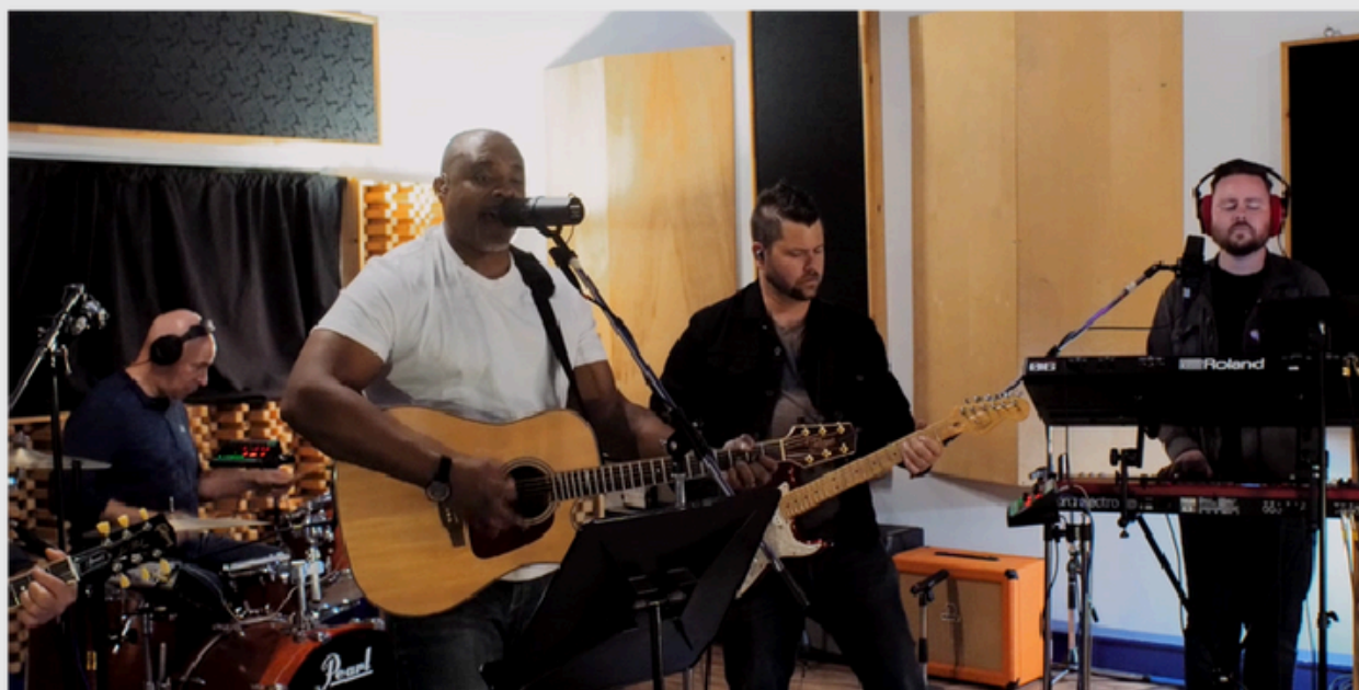
Alright- Darius Rucker (Southern Style Cover).